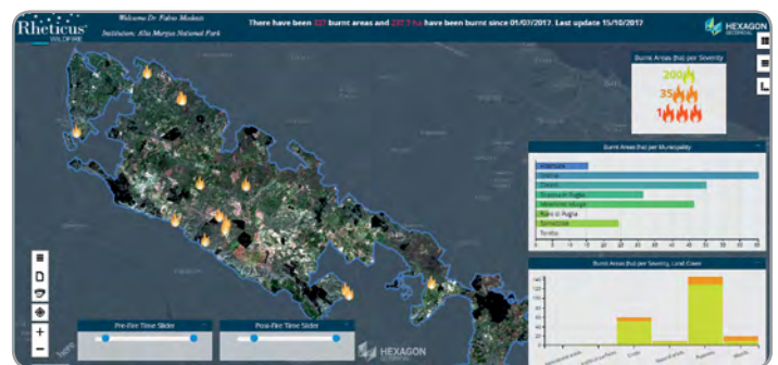
Rheticus® Wildfires User Interface for the Alta Murgia National Park.

Thanks to the high revisit time of Sentinel-2 over the same area (up to 5-6 days) and the high spectral and spatial resolutions of those data, Rheticus® Wildfires provided the Alta Murgia National Park with burnt area detection, and fire severity classification on a weekly basis, vegetation regrowth monitoring (1/year) and detection of potential illegal infrastructure activities within past-burnt areas (4 times/year). Moreover, it helped to prioritise response teams. Data were available via the Rheticus® geo-portal www.rheticus.eu and through pre-set reports.