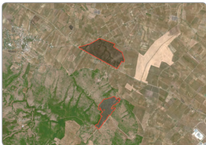
Wildfires automatically retrieved from Sentinel-2 data acquired on 14/07/2017 over the Alta Murgia National Park.

Rheticus® Wildfires simplifies burnt areas detection and contouring from various open data sources into an interactive and comprehensive dashboard, to achieve insightful and purpose-built contents from many different perspectives. Public authorities gain immediate and reliable geo-information, including weekly and summary information over wide areas, based on continual Sentinel-2 monitoring, overcoming the difficulties and costs of field measurement campaigns. Rheticus® Wildfires generates reports, thematic maps and geo-analytics based on Sentinel-2 data, meeting local to national content requirements in the field of burnt area detection and illegal building prevention. It also helps to prioritise response teams. Furthermore, better management of precious vegetation resources is well worth the ecological advantages it gives to the environment and citizens.