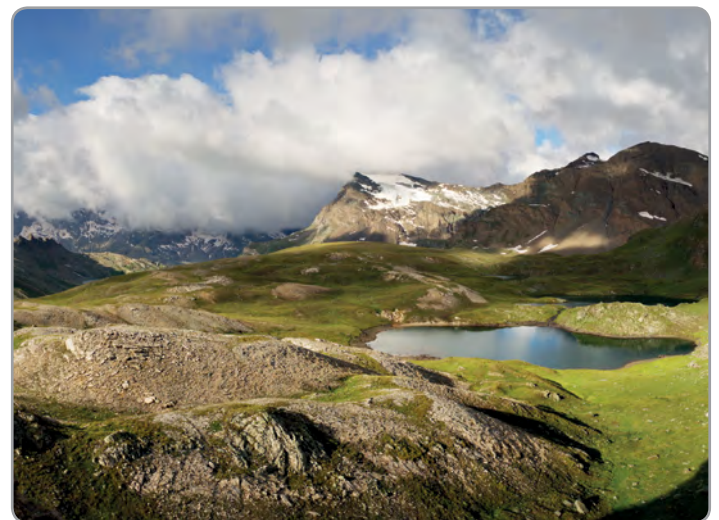
High altitude grasslands at the Nivolet Plain (Gran Paradiso National Park).

In particular, maps of land use change can be used for planning interventions in the management of forest encroachment as well as in informing the management plan of the park and taking decisions regarding permitting.