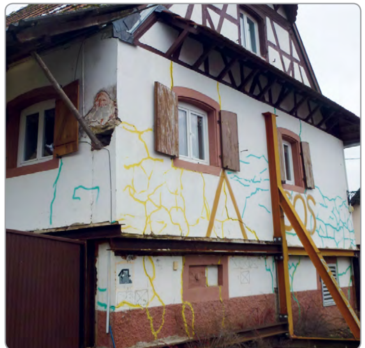
Houses affected by terrain movements in the village of Lochwiller (Alsace- France)

The approach having been validated, the State services asked for the monitoring of the affected sector to be continued and also to apply it on another Alsatian village where a similar phenomenon has started.