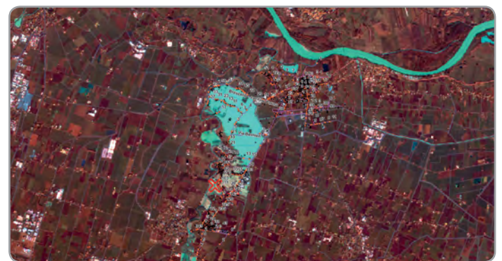
Italy - Reggio Emilia 2017, multispectral image (Sentinel) showing flooded areas, in light blue, near Lentigione town due to Enza river flooding.

The Italian National Fire Corp operates in every regional area, coordinated by a Central Emergency Directorate, a few minutes after events. In the Central Emergency Directorate, we activate a technical team that immediately made a plan based on a cartographic survey of the affected area. The "Space-Based" approach for emergency management, using small-scale geography, allows a stronger awareness of the scenario evolution and therefore a faster and more targeted operational response which provides a more effective and efficient support to the population. Delimitation of an affected area overlapped to, for example, population density allows an estimate to be made of the number of people affected and threatened and to optimise the planning phase of the assistance in terms of the number of rescuers and resources needed.