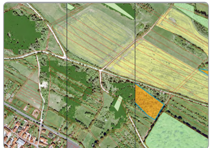
Monitoring of afforestation for a test site in the forest district Hainich-Werratal (from the left to the right): forest mask in green, areas already recognised as forest in light green, new forest areas in orange, orthophotos in the background.

Forests play an important role in the regulation of ecosystems. In addition to multi-faceted range of services, forests are important for the well-being of the human population. Forests fulfill many functions such as the protection of groundwater, against floods, noise protection, provide places for recreation and etc. These are reasons why forest areas are particularly protected by law. In Germany, forests cannot be transferred to other forms of use such as for building development.