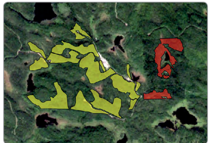
Automatic process classifies forest biomass changes between clear cuts (red) and thinnings (yellow).

The automatic processing chain ensures up-to-date and accurate information about environmental changes. This helps to react faster and make relevant decisions concerning the changed forest area.