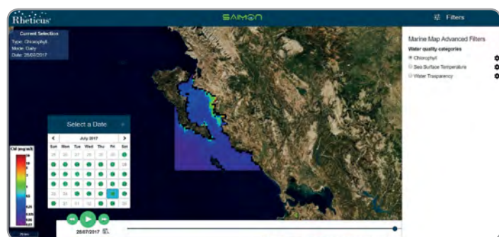
Chlorophyll measurements in SAIMON service for Water Directorate of Decentralized Administration of Epirus and Western Macedonia

With the increasing availability of satellite data through the Copernicus programme and the successful practices and examples that have already been deployed in several sectors, a great range of opportunities in environmental monitoring is presented.