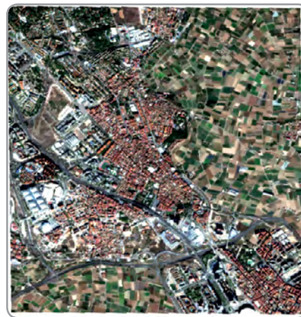
Natural colour RGB (bands 4, 3, 2) image of Burjassot Municipality (Sentinel-2B EMS Copernicus Service, 17 Dec 2017, 10-m spatial resolution)

the combination of Maximum Noise Fraction (MNF) and Principal Components Analysis (PCA) to reduce the spectral dimensionality and selecting the bands with more information. Then, Pixel Purity Index (PPI) is applied to identify three extreme endmembers: high albedo (bright ISA and bare soil), low albedo (dark ISA, water, wet areas and shadows) and vegetation. Classifiers are applied to group both ISA classes (bright and dark) and define the sealed zones. This process is carried out with several images throughout the year to verify changes. Once the final classification is established, it is compared to high resolution images as well as to the Copernicus High Resolution Imperviousness product, by evaluating 100 points that generate a confusion matrix, together with the overall accuracy (OA), producer's accuracy (PA) and user's accuracy (UA).