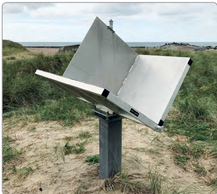
Corner reflector developed by DTU Space & Agency for Data Supply and Efficiency and manufactured by Lemvig Utility. Reflectors serve to link height variations in EO data to the Danish datum network.

The reflectors link to the Danish height system and to the bottom of sewers via traditional leveling techniques. This provides very detailed and precise determination of height changes over time and secures cross-sectorial use e.g. in the construction sector thereby making EO results applicable to the public.